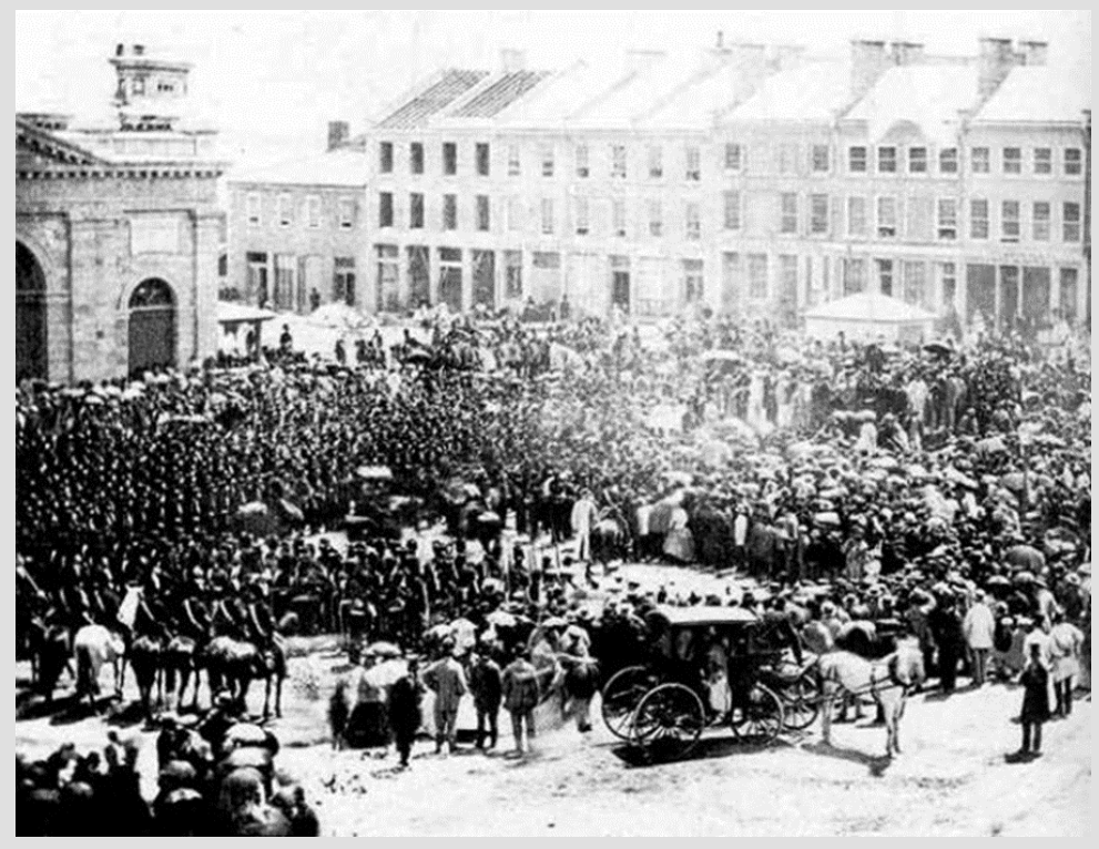
1<sup>st</sup> Canada Day: Reading the Proclamation of Confederation in Kingston, Ontario on July 1, 1867